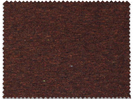
CJ7RDA45 30/1 Ne 100% Cotton 🌱 100% BCI/Organic/Fairtrade Cotton