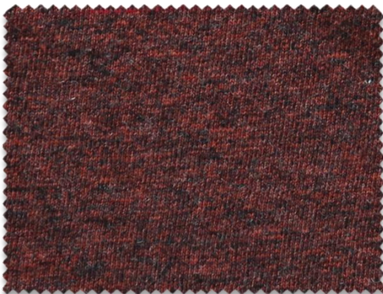
CJ7RDA3W 30/1 Ne 100% Cotton 🌱 100% BCI/Organic/Fairtrade Cotton