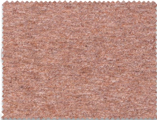
CJ3ORA26 30/1 Ne 100% Cotton 🌱 100% BCI/Organic/Fairtrade Cotton