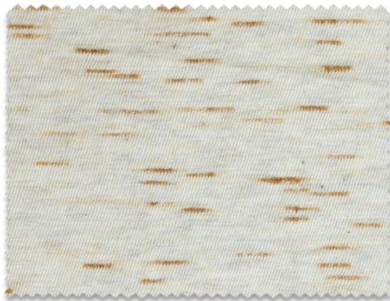
CPI3BRA22 30/1 Ne 52% Cotton, 48% Polyester 🌱 52% BCI/Organic/Fair Trade Cotton, 48% Recycle Polyester

NEPS AND SPOTS LUXURIOUSLY COSY WARMTH MARLS AND TWISTS