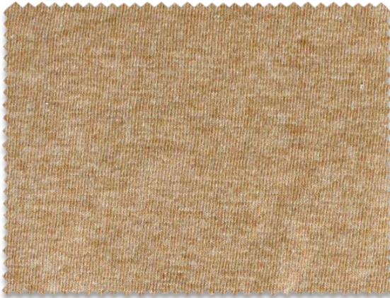
CVLM5BRA00 30/1 Ne 45% Cotton, 35% Viscose, 20% Linen 🌱 45% BCI/Organic/Fairtrade Cotton, 35% Viscose, 20% Linen