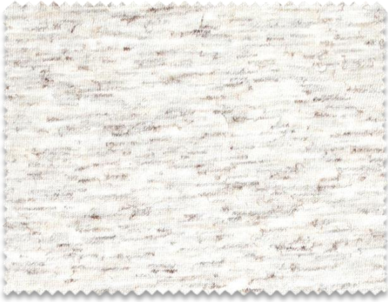
VH2BRA00 30/1 Ne 100% Viscose 🌱 100% Viscose