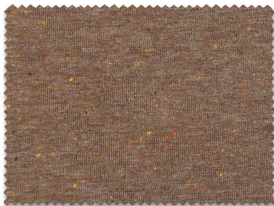
CPN5BRA22 30/1 Ne 96% Cotton, 4% Polyester 🌱 96% BCI/Organic/Fairtrade Cotton, 4% Polyester