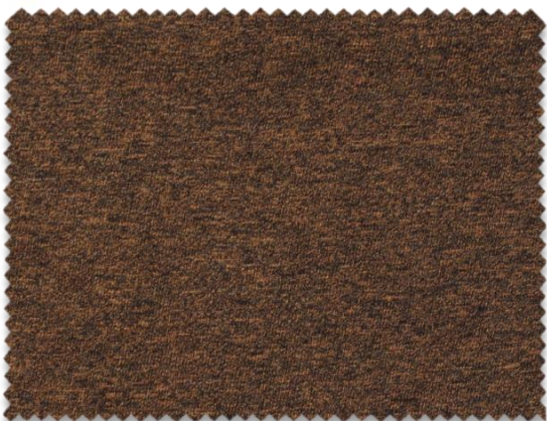
CJ7BRA38 30/1 Ne 100% Cotton 🌱 100% BCI/Organic/Fairtrade Cotton

CONTRAST COLOURATIONS SPACE DYE CAMOUFLAGE BRUSHED OR PEACHED SURFACES