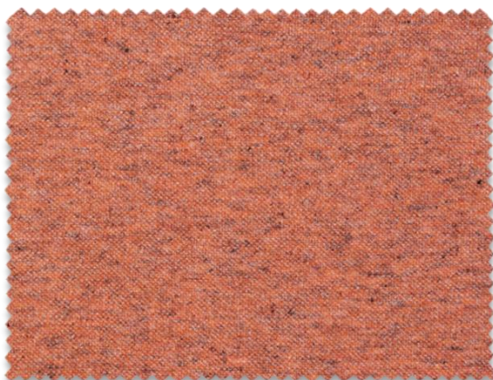
CTQ6OR90 30/1 Ne 100% Cotton 🌱 100% BCI/Organic/Fairtrade Cotton

NEPS AND SPOTS LUXURIOUSLY COSY WARMTH MARLS AND TWISTS